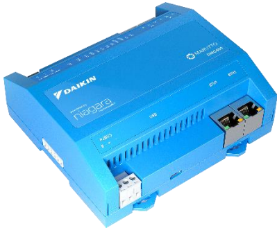
DMC400A8G 4 Core network controller and server

Introducing the new DMC400 series of all-in-one controllers and network management engines. The DMC400 series devices seamlessly integrate with the DMT IO module family and other 3 rd party devices and systems. The DMC series controllers enable unparalleled compatibility to enhance your control infrastructure. Powered by Niagara Framework, the DMC400 series device range empowers your network with advanced integration and control capabilities.